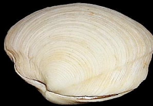
Lucina pectinata clam.