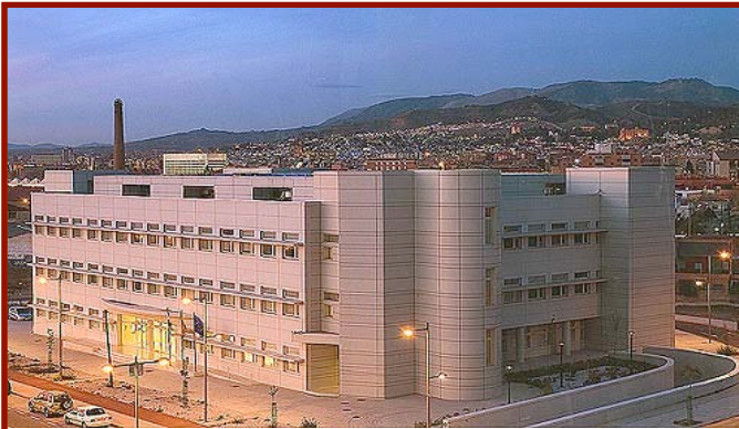
“Laboratorio de Estudios Cristalográficos” (LEC) at the “Instituto de Parasitología y Biomedicina López-Neyra”.Granada, España