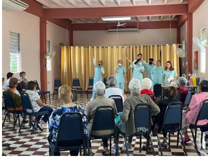
Health promotion at Elderly Center La Milagrosa.