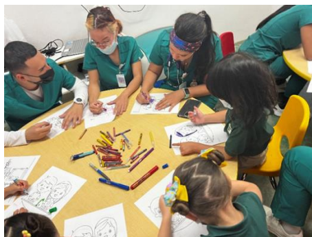
Federico Degetau Elementary School