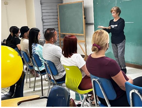
Labor without pain Course