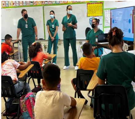
Federico Degetau Elementary School

Health assessment and health education to pediatric population