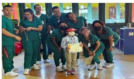
Pre-school UPRM – educative activity on health benefits of starting exercise early in life.