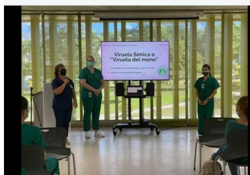
RCM Vital – Healthfair collaboration with the Medical Science Campus- April, 2023