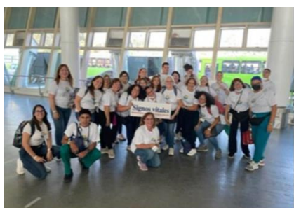
Health Fair – Ferries del Caribe at Santo Domingo, Dominican Republic. Students and Professors providing health promotion activities. March 2023.