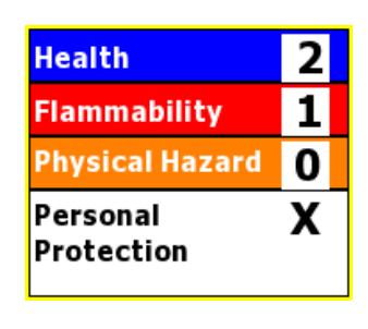
HMIS RATINGS (0-4)