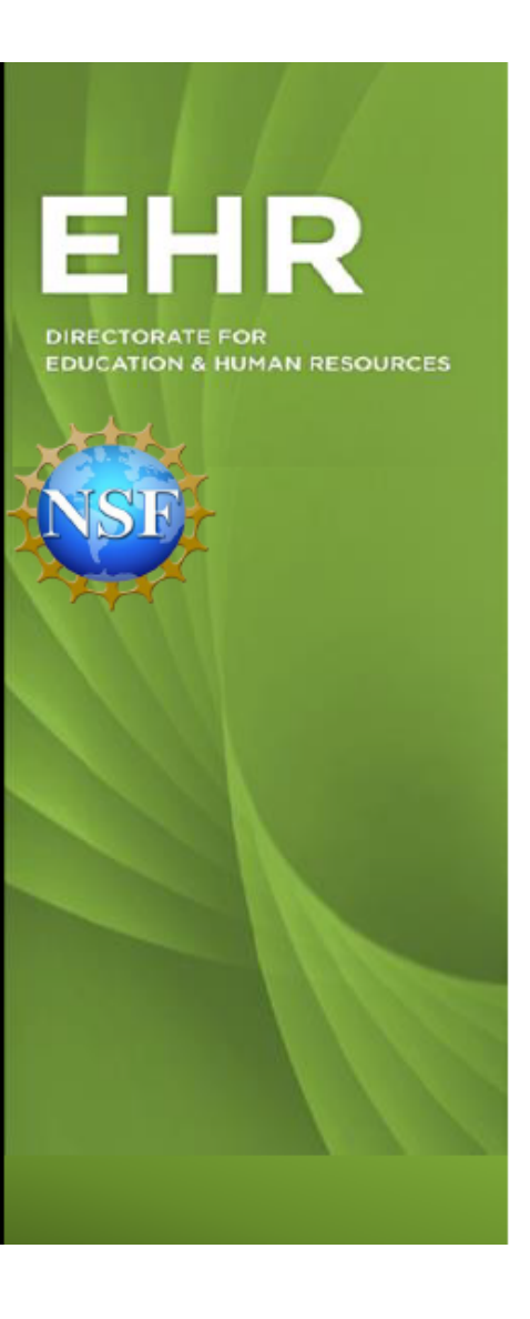
Track 1: Building Capacity