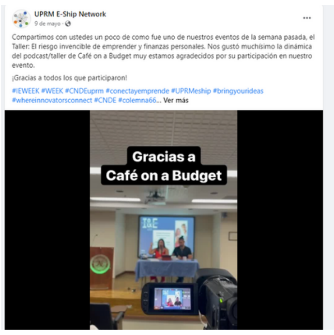
Figure 3: <a href="https://fb.watch/gnX8-pwTLj/">https://fb.watch/gnX8-pwTLj/</a>