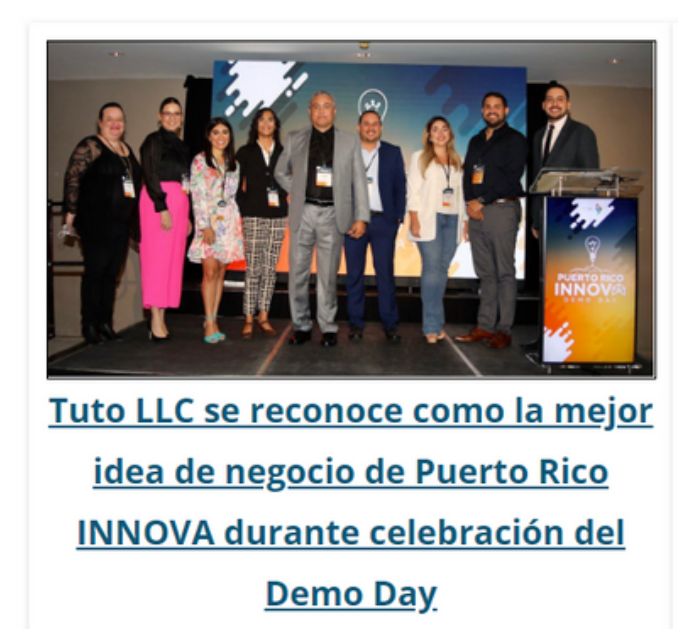
Figure 1: https://www.ddec.pr.gov/tuto-llc-se-reconoce-como-la-mejor-idea-de-negocio-de-puerto-rico-innova-durante-celebracion-del-demo-day

Examples of media coverage of the BEDC's accomplishments, its clients and partnership initiatives.