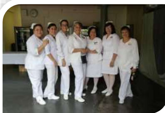
PROFESSORS OF THE NURSING PROGRAM