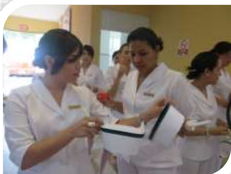
STUDENTS PREPARING FOR THE INITIATION CEREMONY TO THE PROFESSION