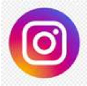
UPRM Nursing Program