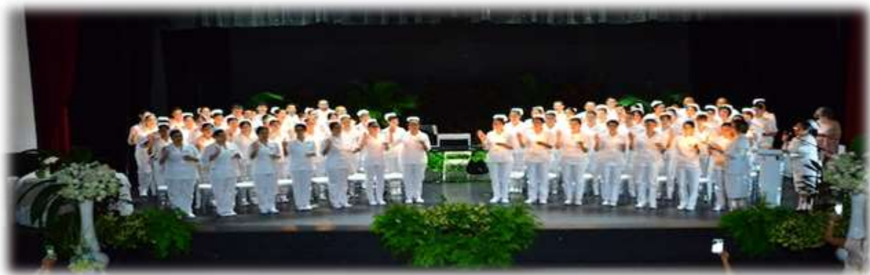
INITIATION CEREMONY TO THE PROFESSION