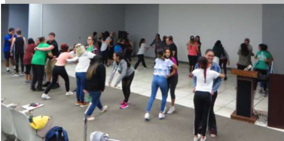
Students of the ENFE 3045 course: Psychiatric Nursing taking the Self Defense course with non-lethal force.

THEY WISH TO CONTINUE STUDIES AT THE UPRM. YOU SHOULD LOOK FOR YOUR APPLICATION AT THE REGISTRAR'S OFFICE AND APPLY ON THE DATES ESTABLISHED BY THE INSTITUTION.