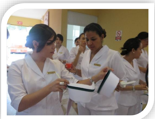
STUDENTS PREPARING FOR THE CAPPING CEREMONY