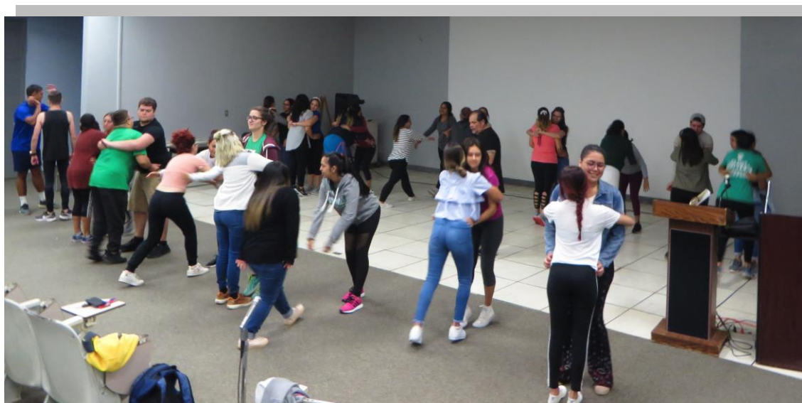
Students of the ENFE 3045 course: Psychiatric Nursing taking the Self Defense with non-lethal force course.

STUDENTS WITH GOOD ACADEMIC PROGRESS WHO VOLUNTARILY DISCONTINUED THEIR STUDIES OR STUDENTS WHO WERE SUSPENDED FOR ONE YEAR DUE TO LACK OF ACADEMIC PROGRESS, MAY APPLY FOR READMISSION IF THEY WISH TO CONTINUE STUDIES AT THE UPRM. THE STUDENT SHOULD LOOK FOR THE APPLICATION AT THE REGISTRAR'S OFFICE AND APPLY ON THE DATES ESTABLISHED BY THE INSTITUTION.