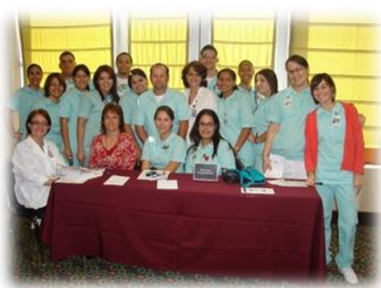
COMMUNITY HEALTH FAIRS