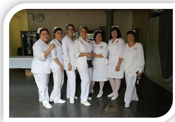
PROFESSORS OF THE NURSING PROGRAM AT THE CAPPING