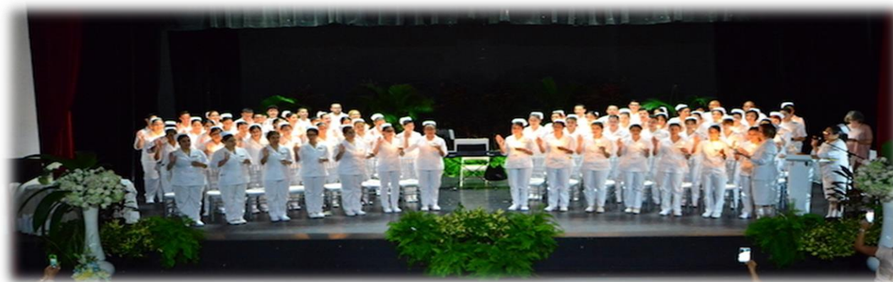
INITIATION CEREMONY TO THE PROFESSION