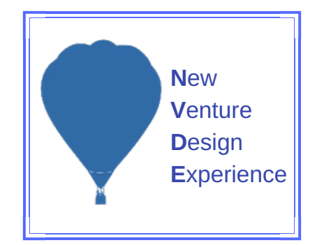
NVDE Be on the look out for the Info Session Tour date at the end of March