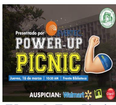
INprende Tour Picnic - March 16 -