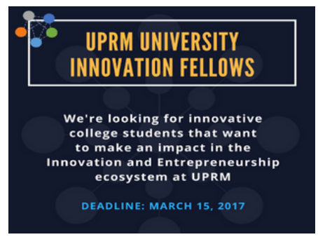
Engineering Entrepreneurship University Innovation Fellows - March 15 -UIF program empowers students globally to become leaders of change. It consists of online training, in-person meetups, mentorship, tools, resources and national convenings.