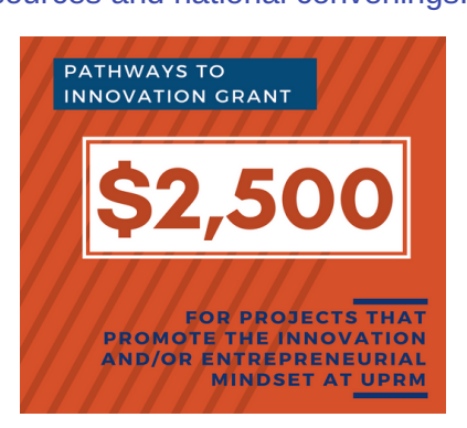
Pathways to Innovation Grant - March 31 -