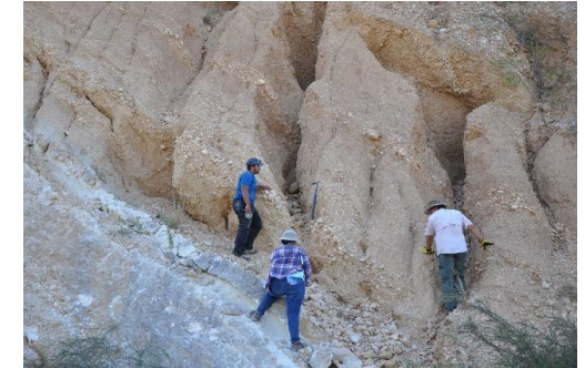
Students and Faculty at Lago Enriquillo, Dominican Republic