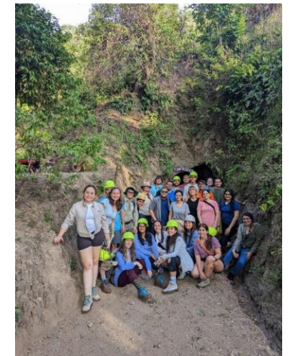
Students and Faculty at a mine in Costa Rica, April 2023

Brochure available at: https://www.uprm.edu/geology/department-and-degree-information/